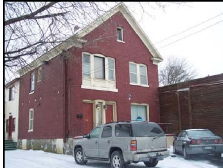
Two family or office