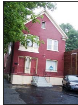
Two family or office