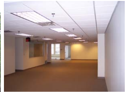
Open Floor Plan