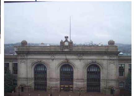
View From Front